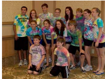
Flyers at Nationals 2009